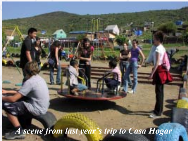
A scene from last year's trip to Casa Hogar

Interact Club members as well as other students, collected food, shoes, balls, coloring books/crayons, and hygienic products that they donate to the orphanage. The kids and adult chaperons assembled crafts, played with the children and helped out with the daily chores such as laundry and washing dishes.