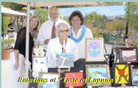
Rotarians at "Taste of Laguna"