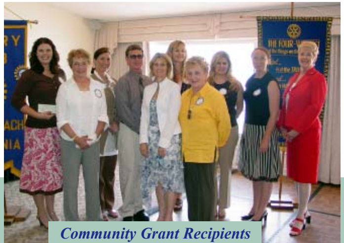
Community Grant Recipients