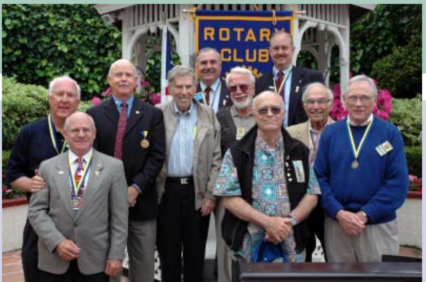
▲ CONGRATULATIONS PHFs ▼