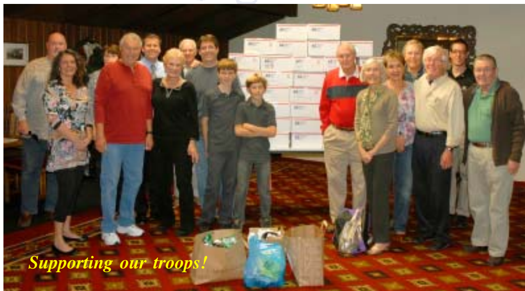
Supporting our troops!